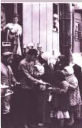
THE RESULTS OF THE SAVE THE CHILDREN FUND. WESTERN MICHIGAN AND SUNDAY'S CHILDREN IN MICHIGAN ...