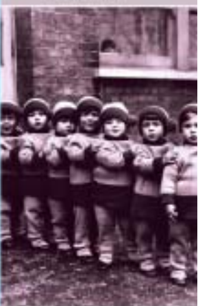
THE WORLD'S CHILDREN