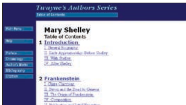
▲ More than 600 authors from all time periods are covered in detail