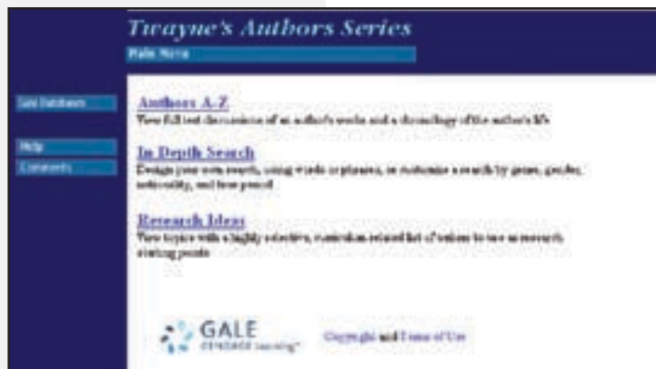
▲ Users can browse a list of author names or search by specific criteria

This series spans the literary tradition through hundreds of years and includes 600 authors from around the world — from Aeschylus to Iris Murdoch. In addition to critical introductions to the lives and works of these authors, Twayne's Authors Series also illuminates the history and influence of literary movements and the development of literary genres. Each treatment devotes 175 to 200 pages to the critical interpretation and discussion of one author's life and works, taking into account important contributions to scholarship and criticism.