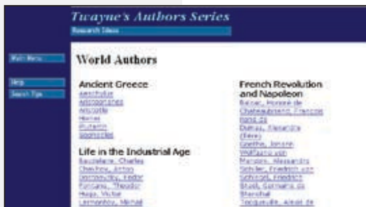
▲ The database also features suggested Research Ideas

Twayne's Authors Series is available independently or as an integrated, add-on module of the Literature Resource Center , providing simultaneous searching of several Gale® databases through a single interface.