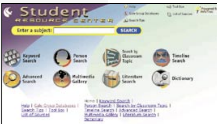
▲ A variety of search options is available, including the opening Subject Search

This revolutionary Web-based application is offered exclusively to junior high schools. It is available for classroom and library work stations and can be made available to remote users as well.