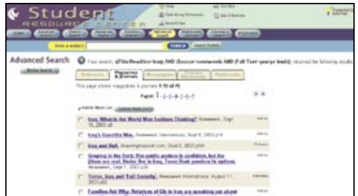
▲ The Advanced Search helps users pinpoint the right information