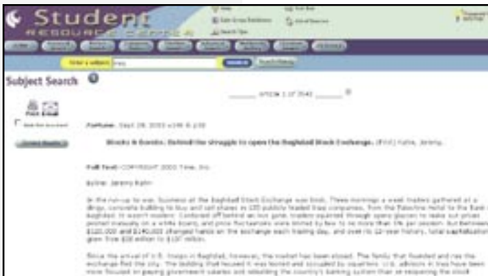
▲ Full-text articles from more than 300 magazines and journals are updated daily