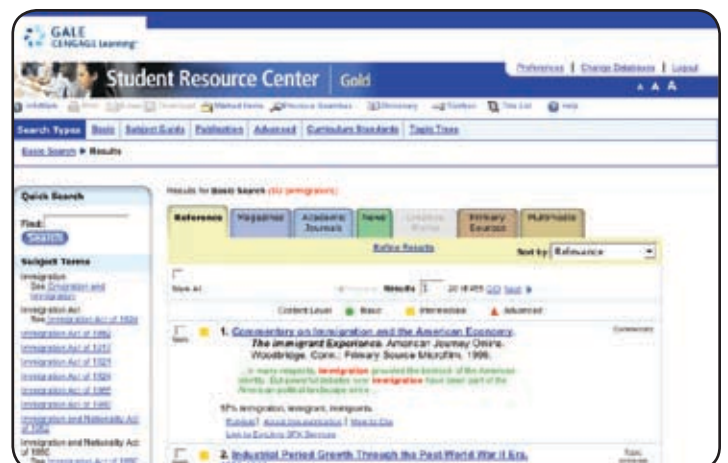
▲ Student Resource Center has an easy-to-use interface.