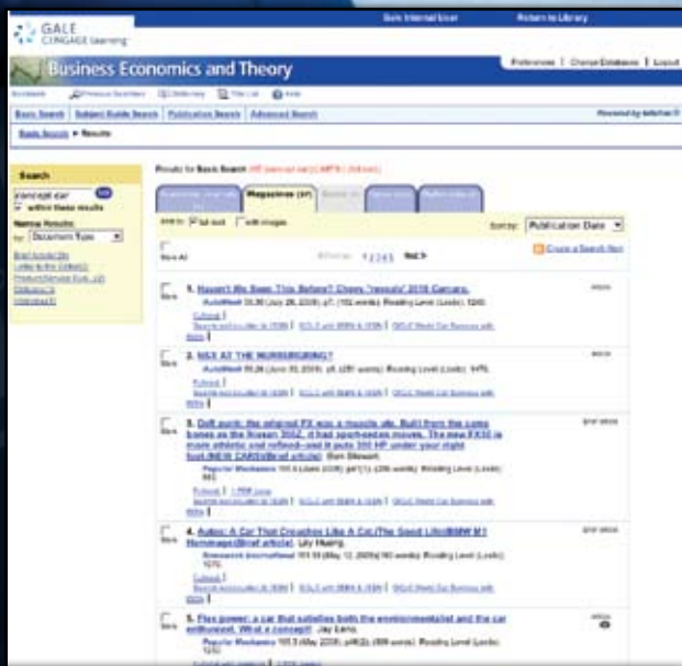
↑ Results from your search can yield content from magazines, academic journals, books, news and multimedia.

Rush to give your patrons the rich online resource they need for their business and economics research projects. Subscribe to Business Economics and Theory Collection today.