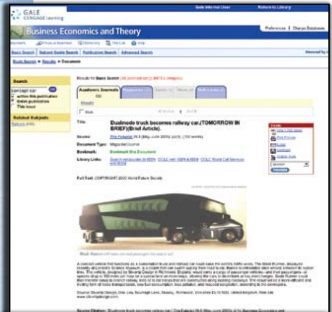
↑ Easy-to-understand information is returned quickly.