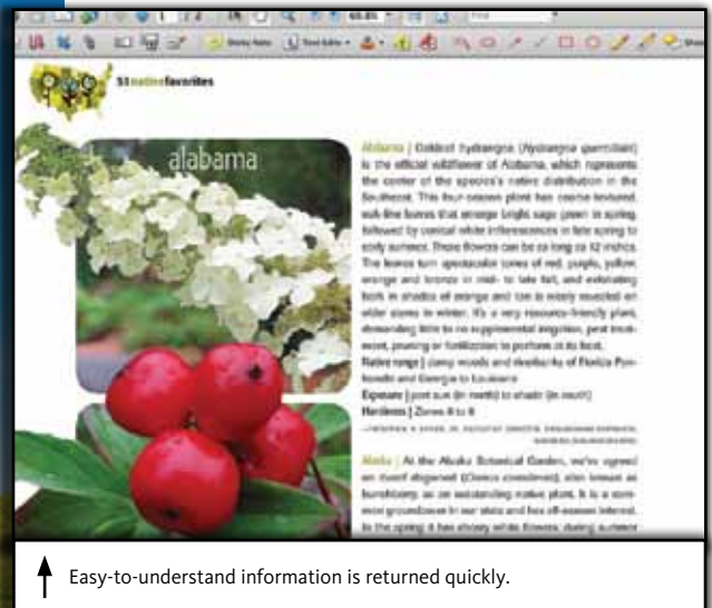
↑ Easy-to-understand information is returned quickly.