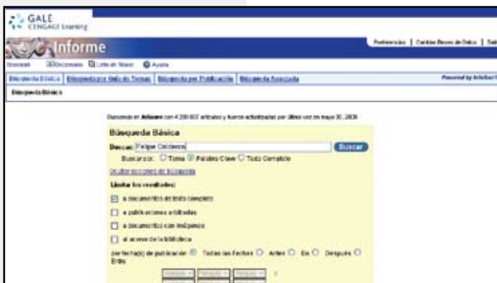
▲ The main search page offers a variety of search options, including a quick keyword search