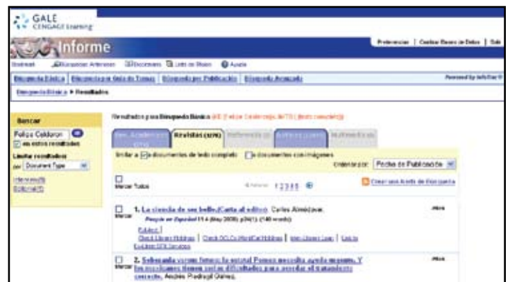
▲ Results provide complete citations for retrieved articles