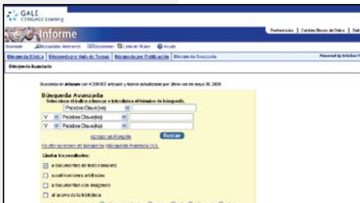
▲ Users can also search by more precise criteria using the Advanced Search