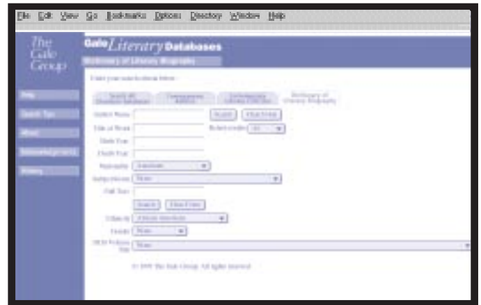
▲ A variety of search options provide patrons with concise research results

Dictionary of Literary Biography is available via subscription through The Gale Group's online reference service, GaleNet. To further explore Dictionary of Literary Biography , go to www.galegroup.com . For additional product or pricing information, call your Gale Group Representative at 1-800-877-GALE.