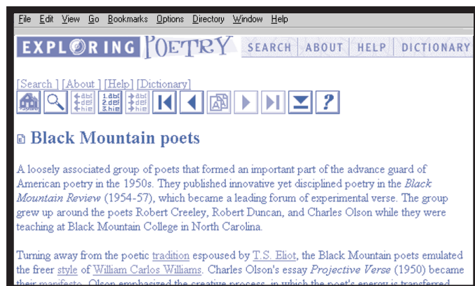
▲ Choose EXPLORING Poetry via the Internet for universal access by multiple users

The Gale Group GALE RESEARCH INFORMATION ACCESS COMPANY PRIMARY SOURCE MEDIA