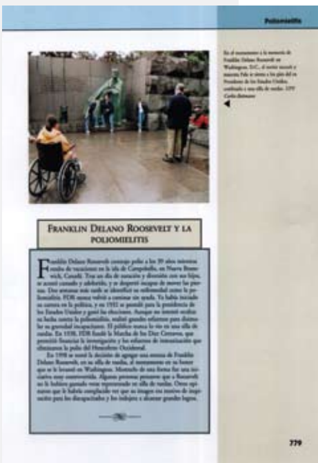
The set, which is filled with helpful sidebars and illustrations, is accessible and appealing

1st Ed. About 1,200 pp. in 3 vols. 2004. In print. ISBN 0-684-31273-5. Order #GML28108-187146.