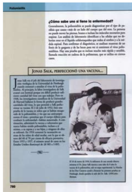
Printed in full-color, the set provides up-to-date, accurate information on approximately 280 diseases and conditions