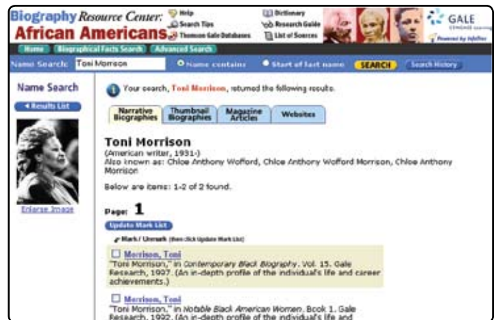
▲ Searches yield results that include portraits, links to Web sites, full-text articles and recent news briefs