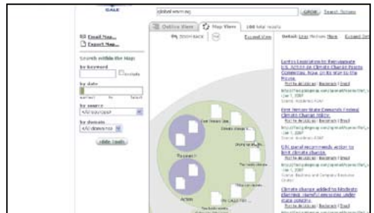
▲ Squares represent the actual articles within each subject group; users simply click to dig deeper