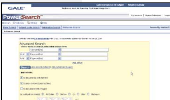
▲ The basic advanced search screen provides a Google-like experience, returning results from all your PowerSearchable Gale databases