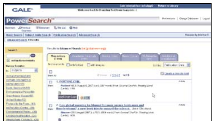
▲ Search results are provided in an easy to understand tabular format