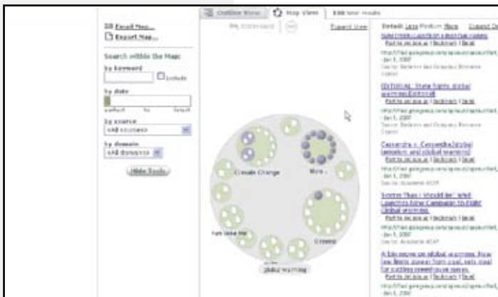
▲ Circles represent the categories into which search results are grouped