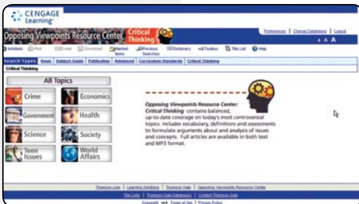
▲ Same easy-to-use interface as Opposing Viewpoints Resource Center