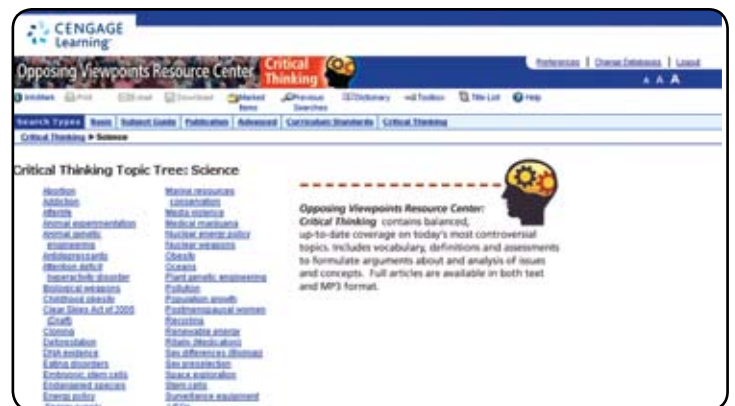
▲ Content covers 250 of the most assigned topics