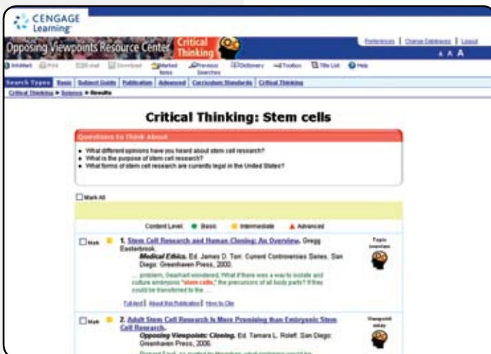
▲ Searches produce articles: an overview and opinions supporting and opposing the topic

Opposing Viewpoints Resource Center: Critical Thinking is a must-have addition for any library dedicated to preparing students for the real-world.