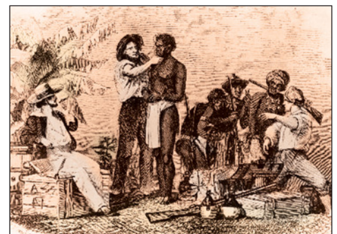
Goldsmiths'-Kress contains more than 1,100 titles on slavery and moves toward its abolition in the western democracies