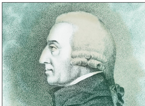
Adam Smith, a Scottish economist and professor (1723-1790), believed that in a laissez-faire economy the impulse of self-interest would work toward the public welfare