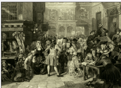
Discussion of "The South-Sea Bubble" — a noteworthy stock market scandal surrounding the South Sea Company's rise and fall in the years prior to 1720