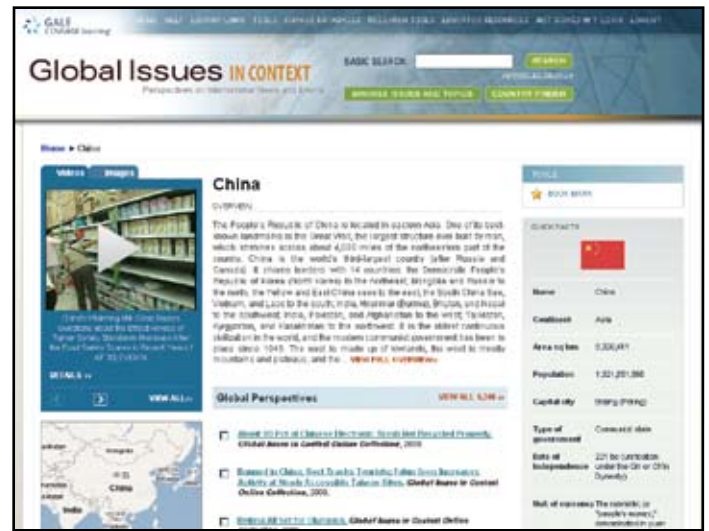
▲ Nearly 200 Country Pages provide an overview as well as perspectives on the land, its people, political and economic climate, geography and more