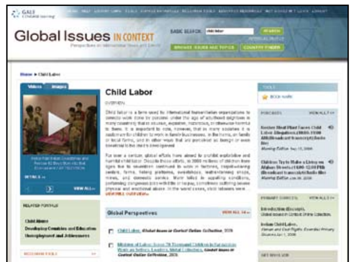
▲ 250 Issues Pages, compiled by Global Issues in Context editors, provide an intellectual framework for understanding the topic and its impact around the world