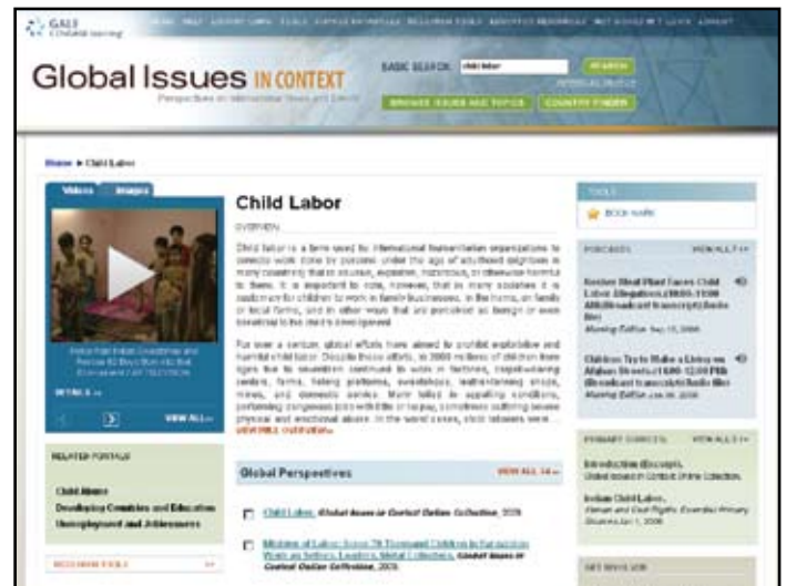
▲ 250 Issues Pages, compiled by Global Issues in Context editors, provide an intellectual framework for understanding the topic and its impact around the world