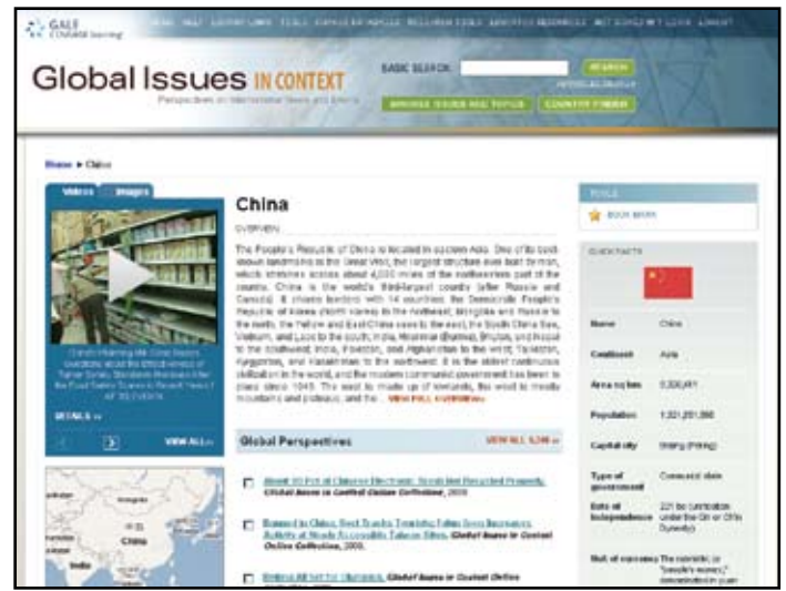
▲ Nearly 200 Country Pages provide an overview as well as perspectives on the land, its people, political and economic climate, geography and more

Statistics: Interactive and static graphs, tables, and charts providing empirical data to support results