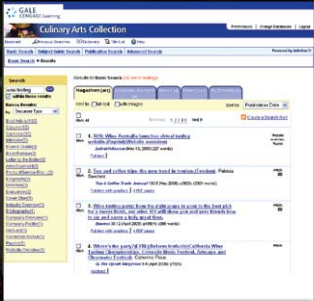
↑ Results from your search can yield content from magazines, academic journals, books, news and multimedia.

The Culinary Arts Collection is truly a well-rounded and informative resource suitable for the novice, the student and the professional chef. So go ahead – serve up fast, fresh information for researchers in your library. Give them the Culinary Arts Collection today.