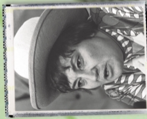
NAME: Bella Abzug KNOWN ALIAS: Battling Bella LAST TOWN LOCATION: Gale's Biography Resource Center