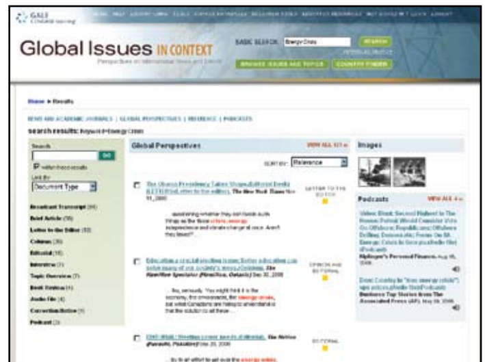
▲ In-depth content ready to read, e-mail, print or save to retrieve later. Related topics and search terms facilitate deeper research