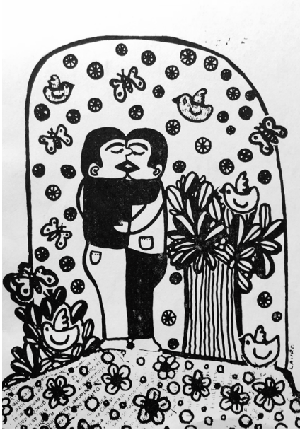
Ephemera from the Canadian Vertical Files at The ArQuives.