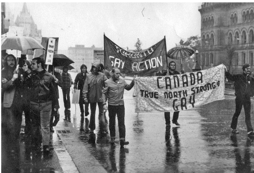
Between 100 and 200 people participated in the Toronto Gay Action protest on August 28, 1971. Jearld Moldenhauer, "Ottawa March Demonstrators," The ArQuives Digital Exhibitions.